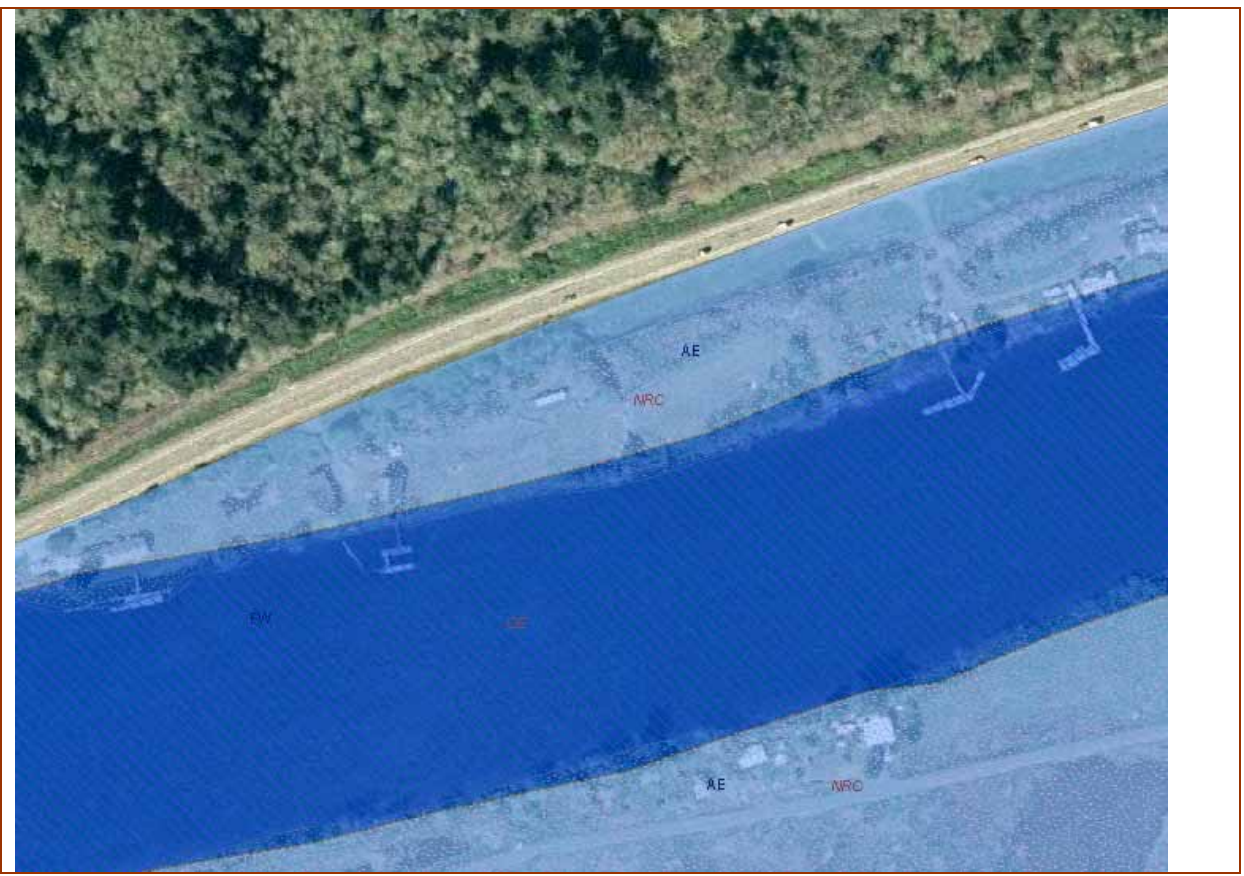
Vicinity of DMDP Site 32 - Coastal Resource Management Plan zoning designations. • Flood Hazard Areas: Light Blue = Floodplain; Darker Blue = Floodway. (Above)